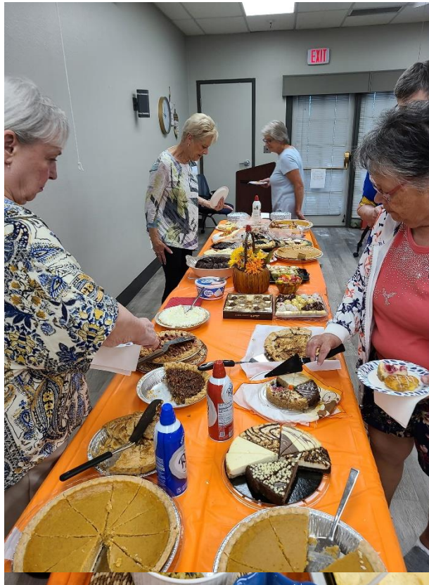
Turkey and Ham were purchased by the club. The members brought side dishes and desserts to share.